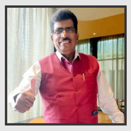
Most Awarded Ranji Trophy Cricketer in India for his outstanding voluntary contribution to sports