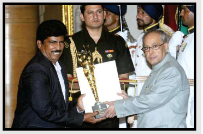
President of India Awardee [In Social Change - 2015]