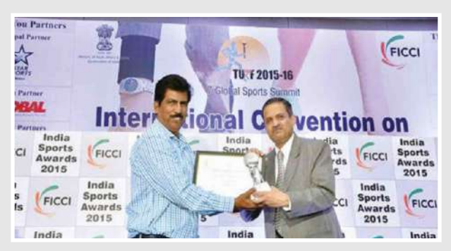
FICCI Best Sports NGO Award (New Delhi) - 2016