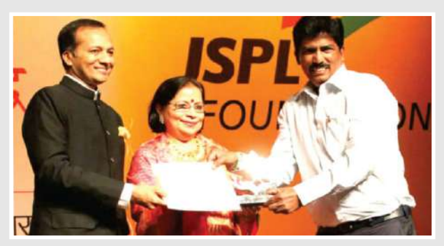
Jindal Health Award (New Delhi) - 2016