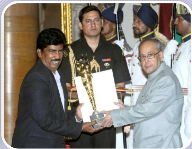
Rashtriya Khel Protsahan Puraskar from President of India in Social Change – 2015. Click here for Video