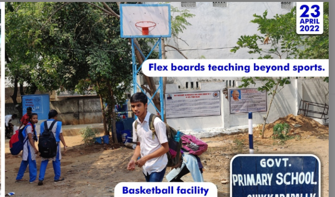
Flex boards teaching beyond sports.