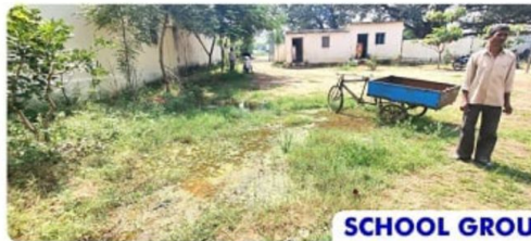
SCHOOL GROUND BEFORE