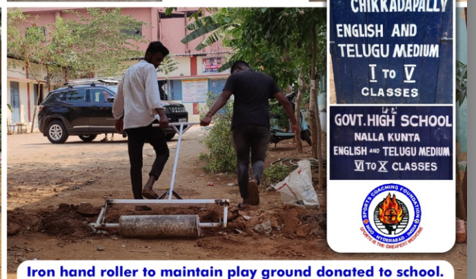
Iron hand roller to maintain play ground donated to school.