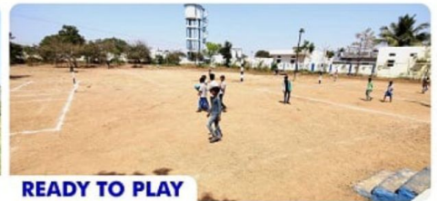
READY TO PLAY

TRANSFORMING GOVT. SCHOOLS BY PUMPING SPORTS CULTURE, SPORTS COACHING FOUNDATION ONGOING PROJECT AT CHIPPALAPALLI, RR DISTRICT, TELANGANA.