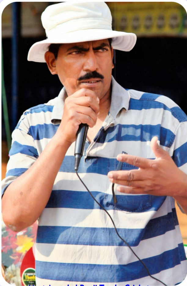
Most Awarded Ranji Trophy Cricketer in India for his outstanding voluntary contribution to Sports.