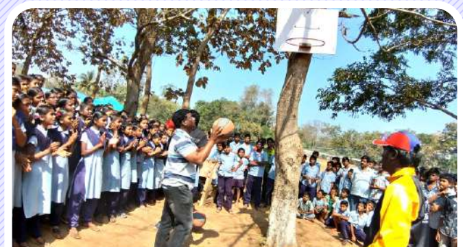
SCF AT RURAL GOVT. SCHOOL