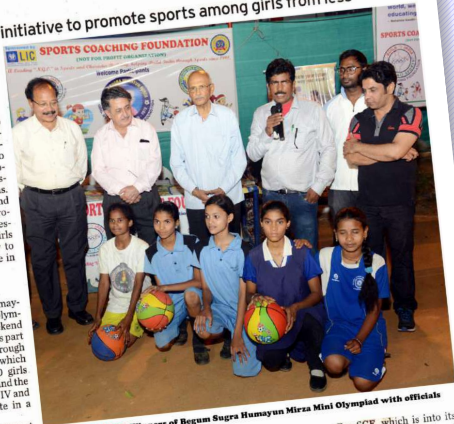
MOMENT OF PRIDE Winners of Begum Sugra Humayun Mirza Mini Olympiad with officials