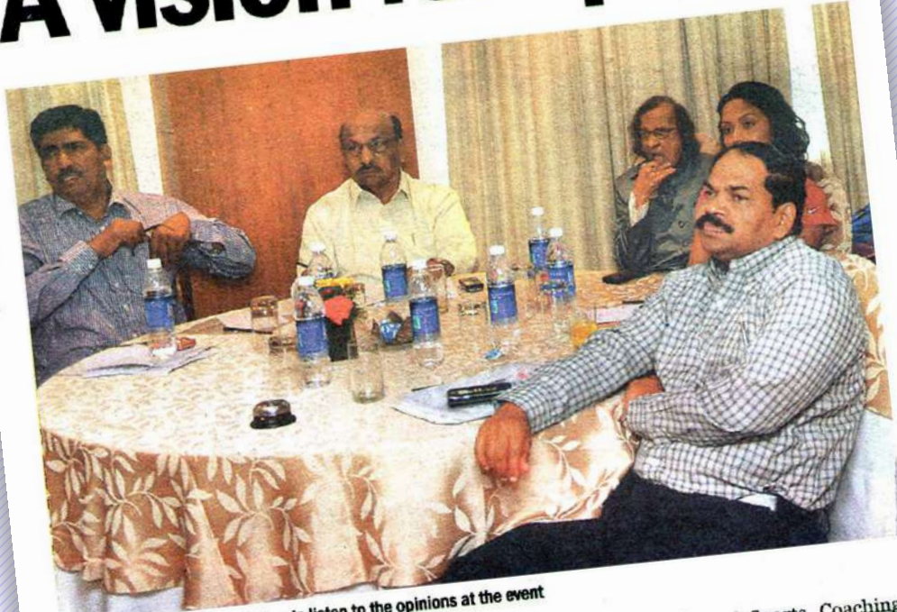
FOCUSED: Dignitaries and guests listen to the opinions at the event