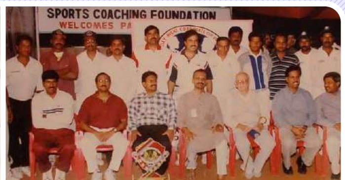
BUREAUCRATS AND POLITICIANS ALWAYS ENCOURAGED SCF ACTIVITIES