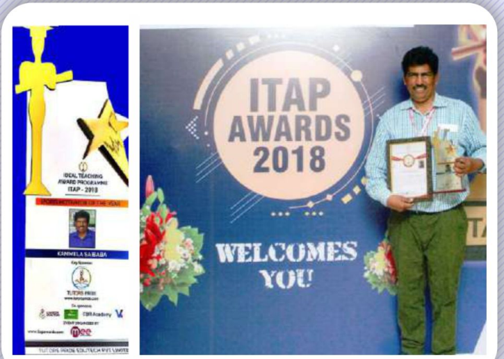
IDEAL TEACHING AWARD PROGRAMME (ITAP) - 2018 KAMMELA SAIBABA Sports Coaching Foundation