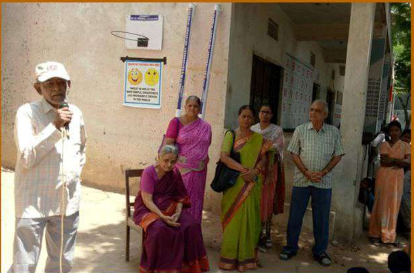
A Volunteer Addressing The Gathering...