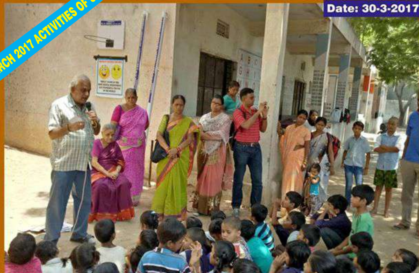
Volunteers inspiring the children...