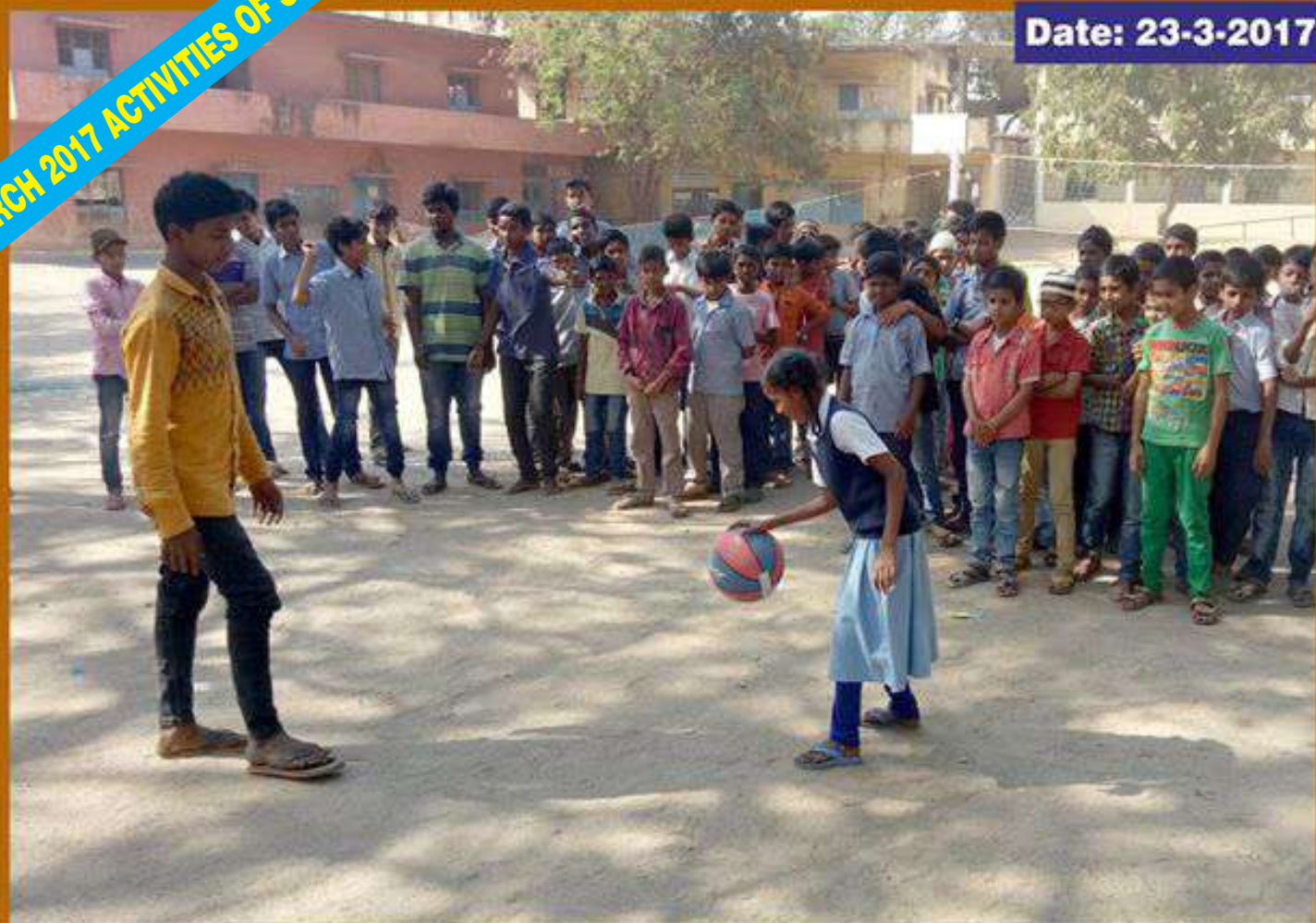
Girls confidently dribbling the ball (In their very first attempt)...