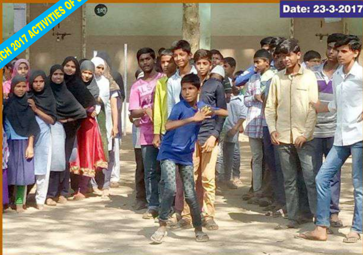
'Hit the target' drill of the SCF Sports Class...