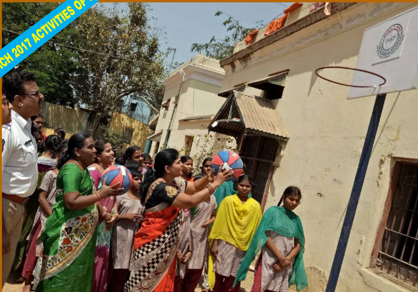
Juvenile Home Staff in action...