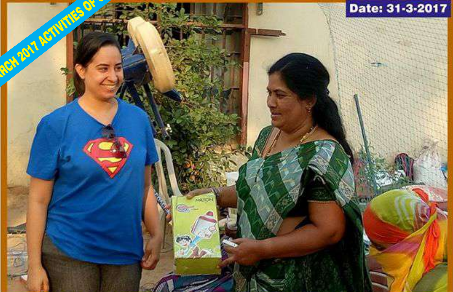
Google Staff distributing Gifts to the Staff of Girls Jvenile Home...