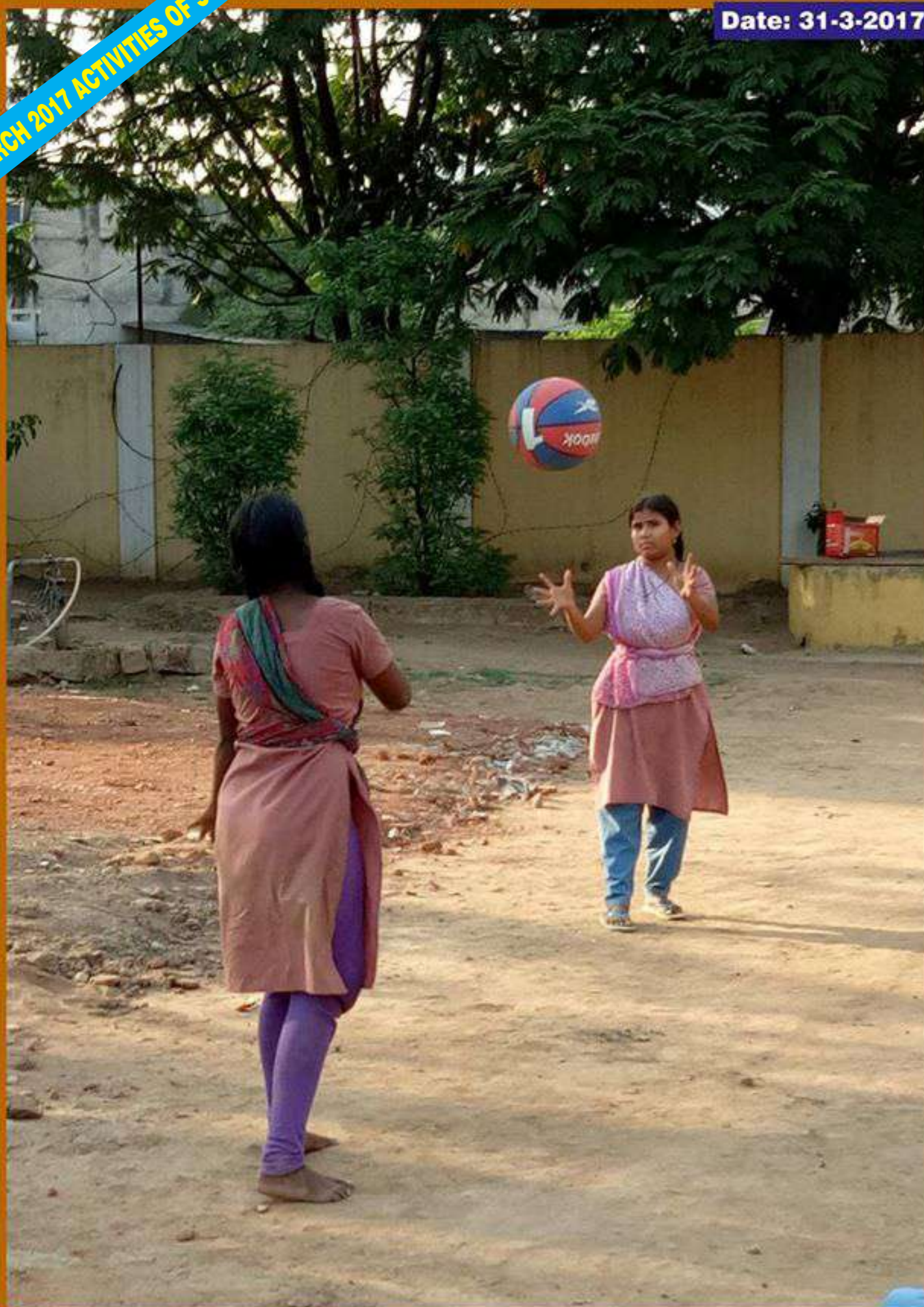
Girls inspired by Basketballs donated by SCF...