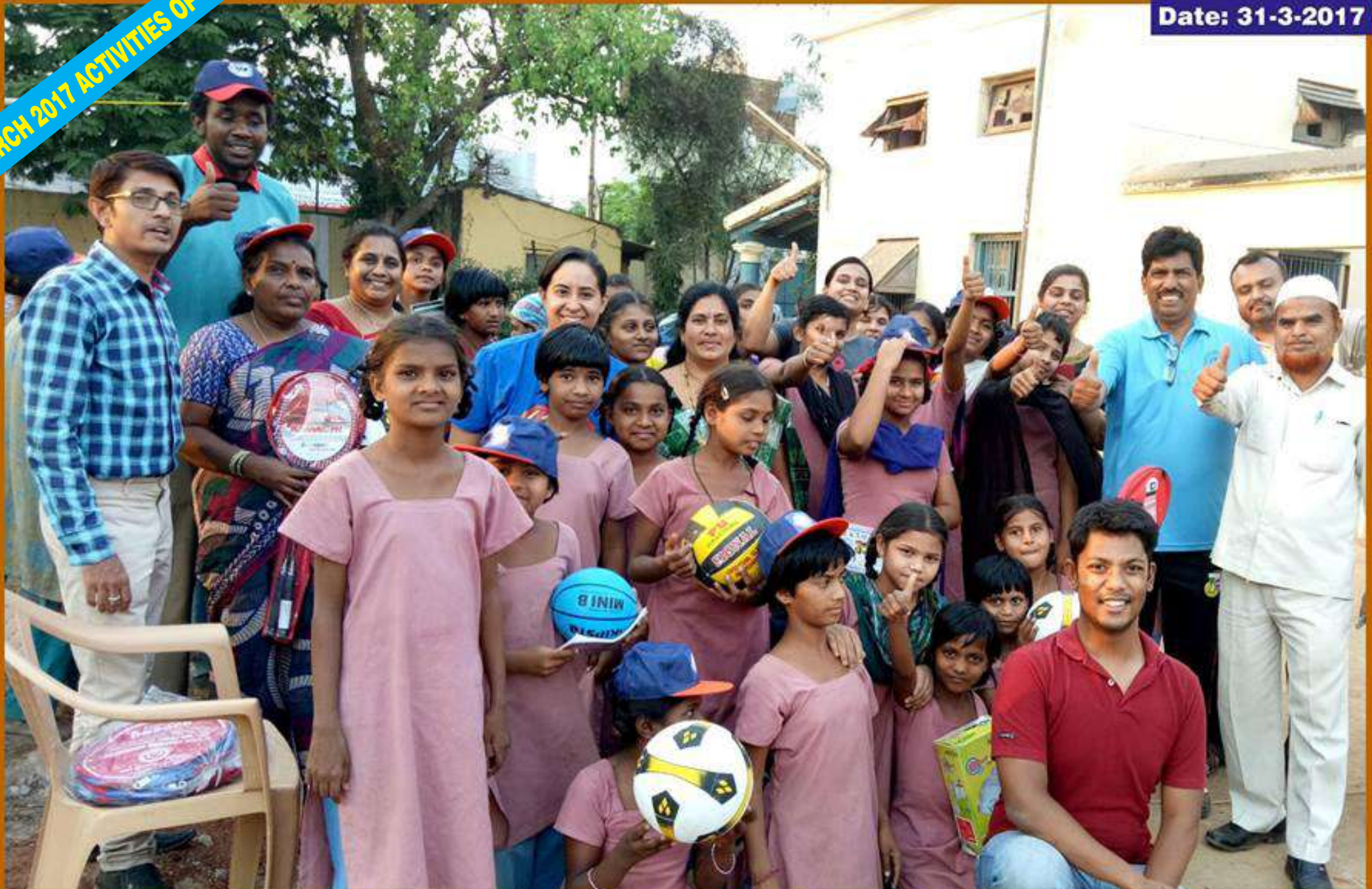
A Group Photograph at the Girls Juvenile Home Hyderabad