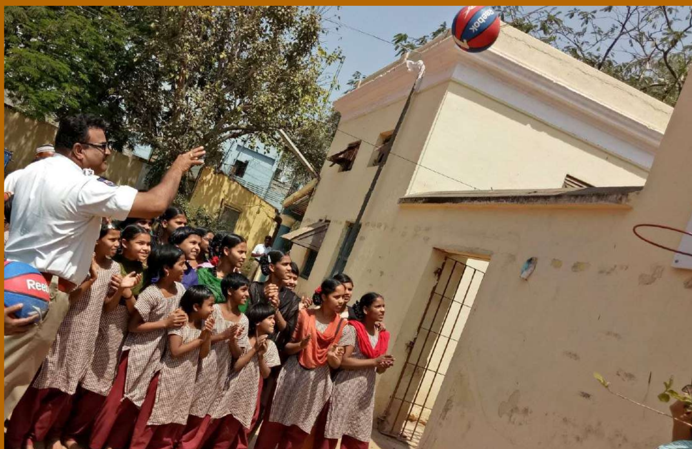
Local Traffic Inspector shooting the Hoop...