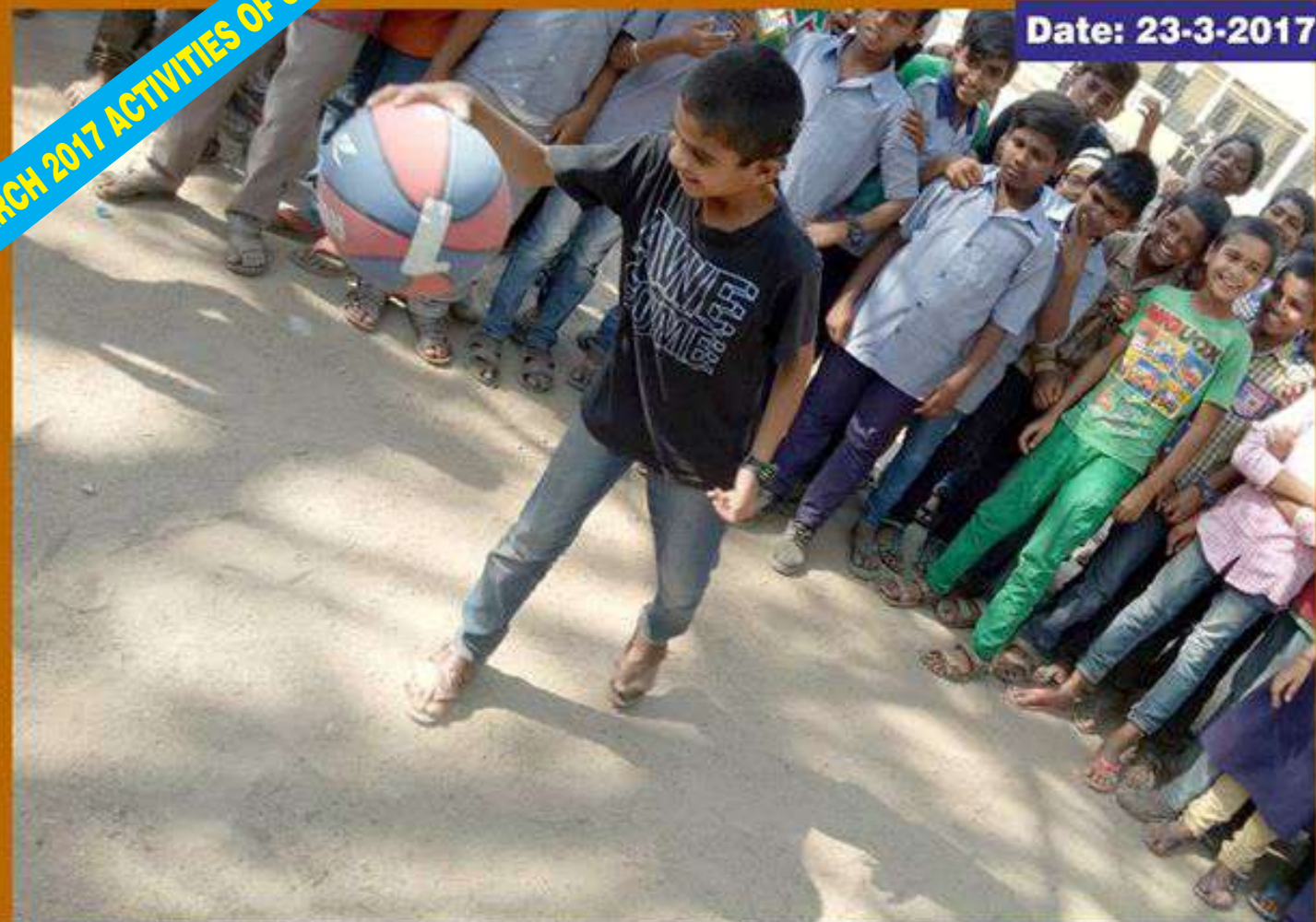
School Physical Director is a role model to BPL children...