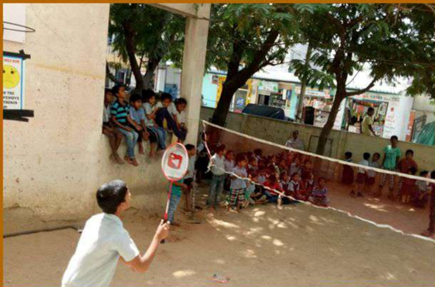
BPL Children participating in Badminton...