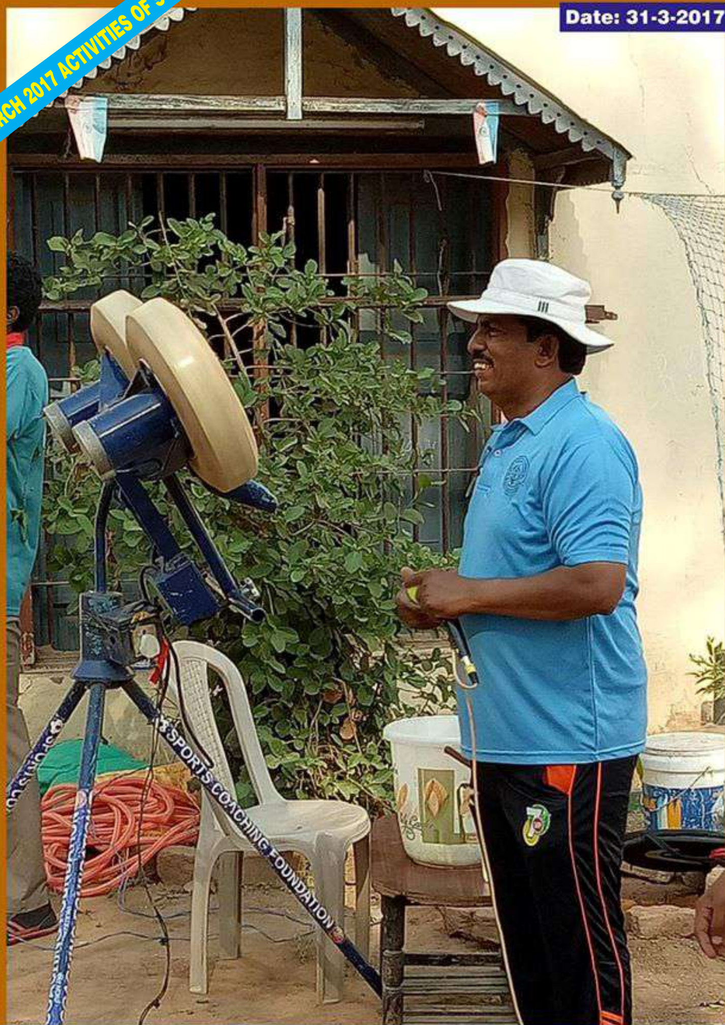
Electronic Pitching Machine to attract girls into "Sports"...