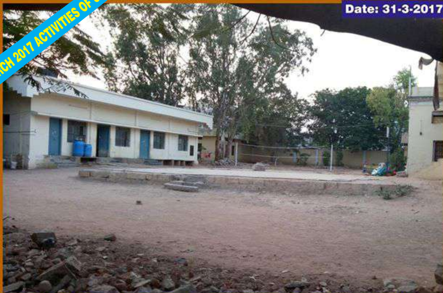
SCF transformed the unused campus area into a Sports Facility...