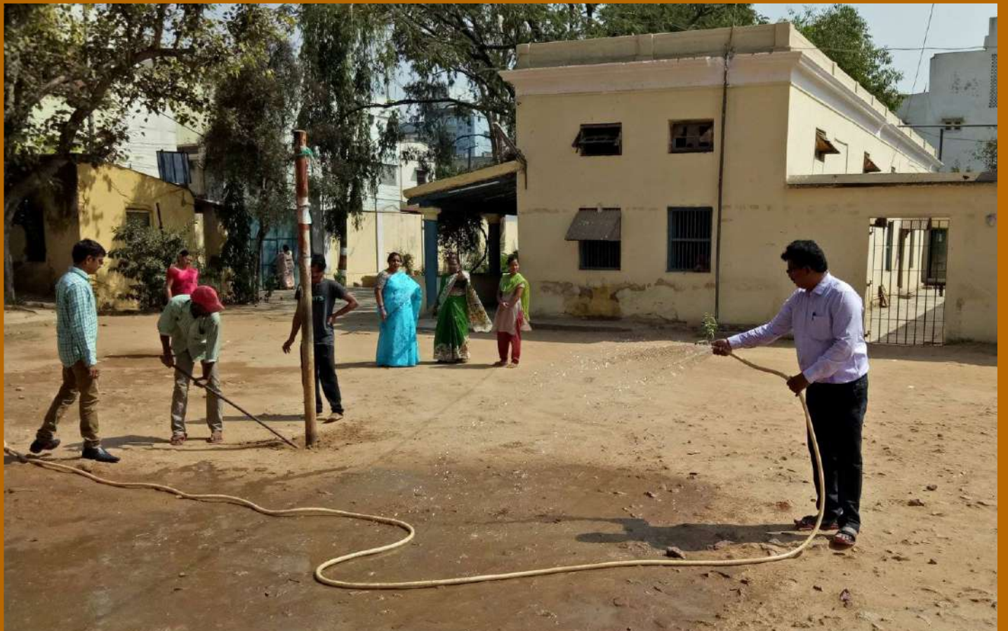
SCF supported a Govt. Juvenile Girls Home at Nimboliadda, Kachiguda, Hyderabad Video Link: Click here