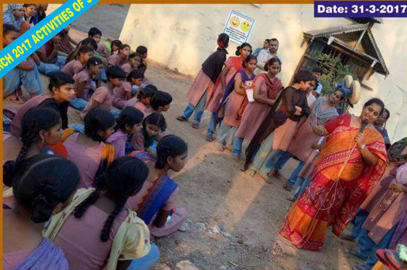
Deputy Supt. of the Juvenile Home expressing gratitude to the SCF Team...