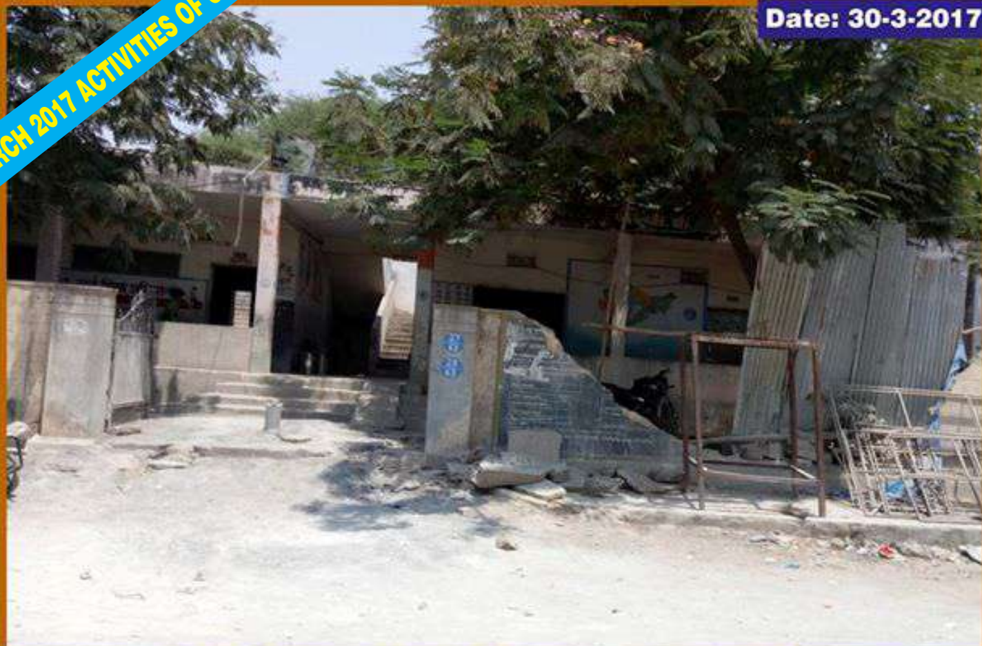
Govt. Primary School, Raheempura, Hyderabad...