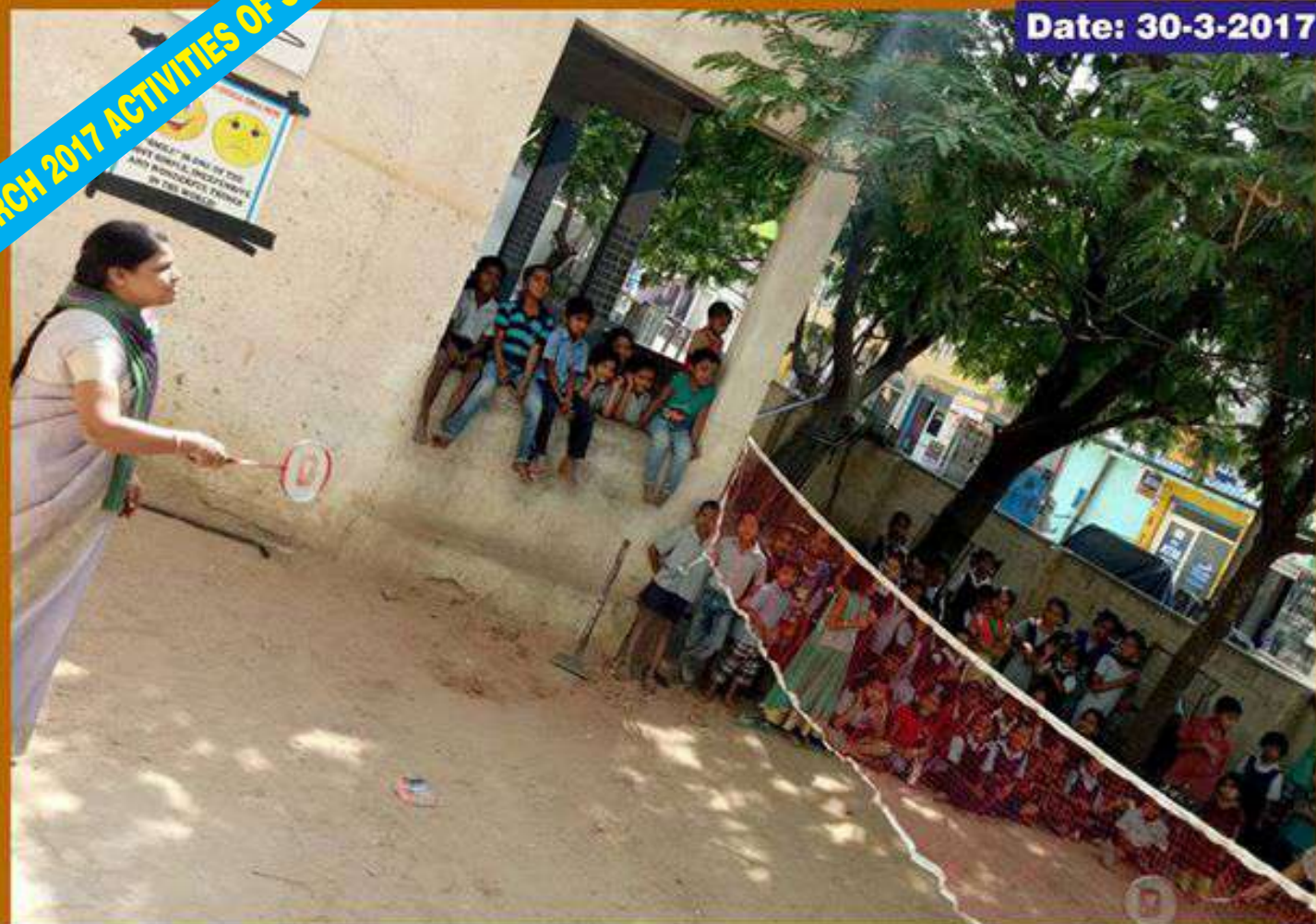
School Staff in Sporting Action...