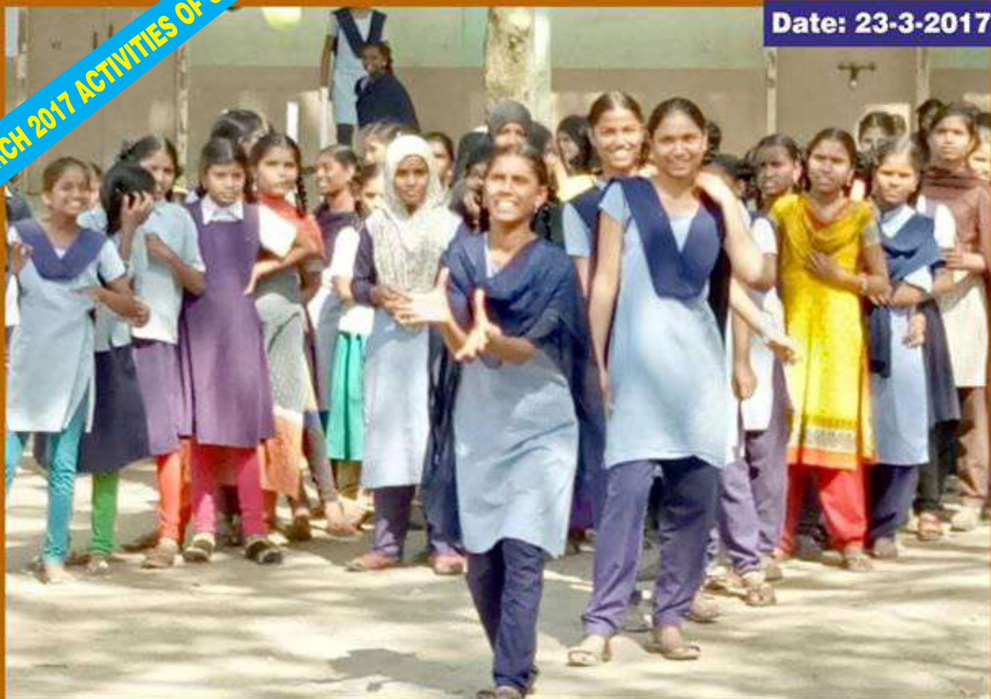
'Focus on the ball'...