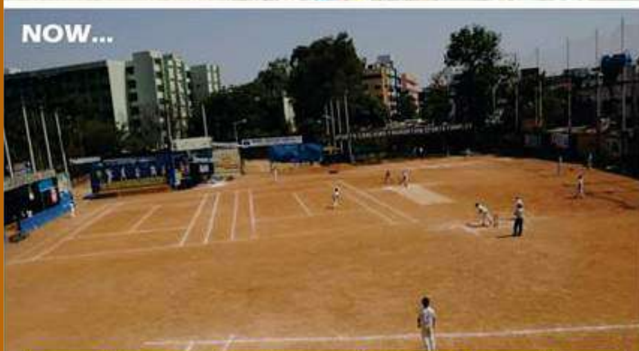
Stagewise Transformation of Playground against all odds...