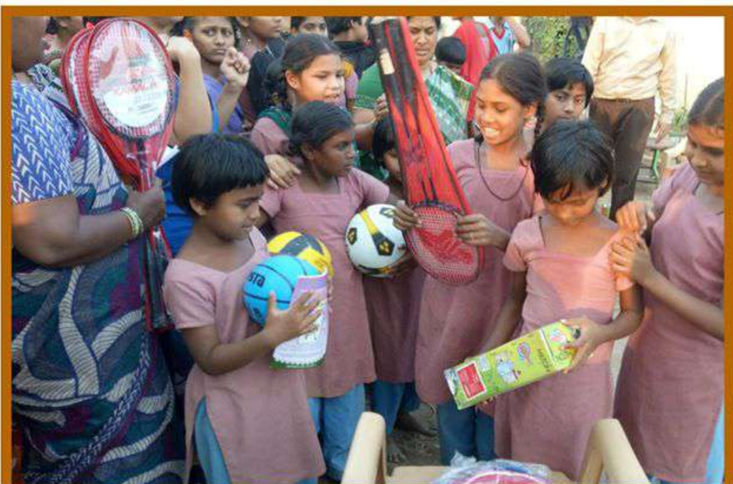
Juvenile Girls - mesmerized with the Sporting Gifts...