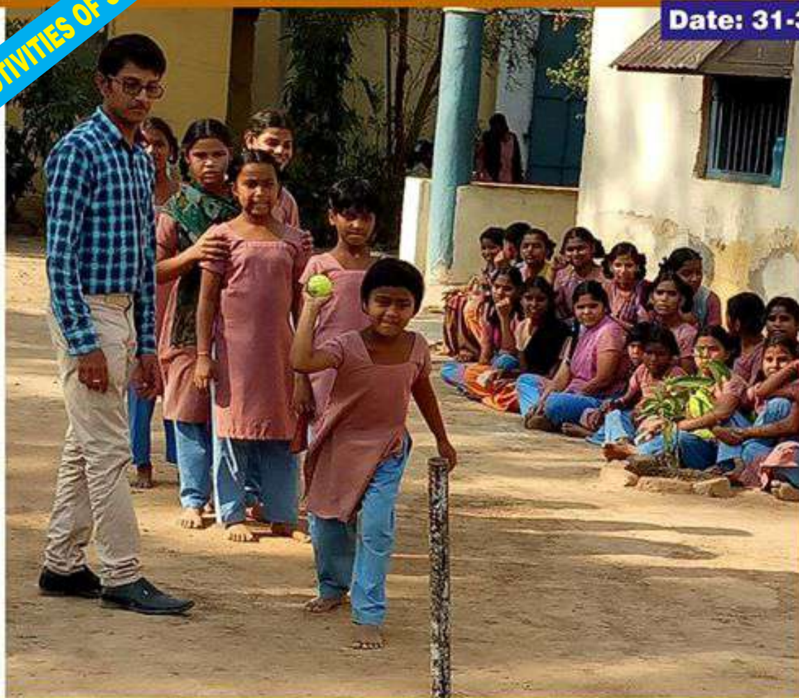
Juvenile Home Girls trying to “Hit The Target”...