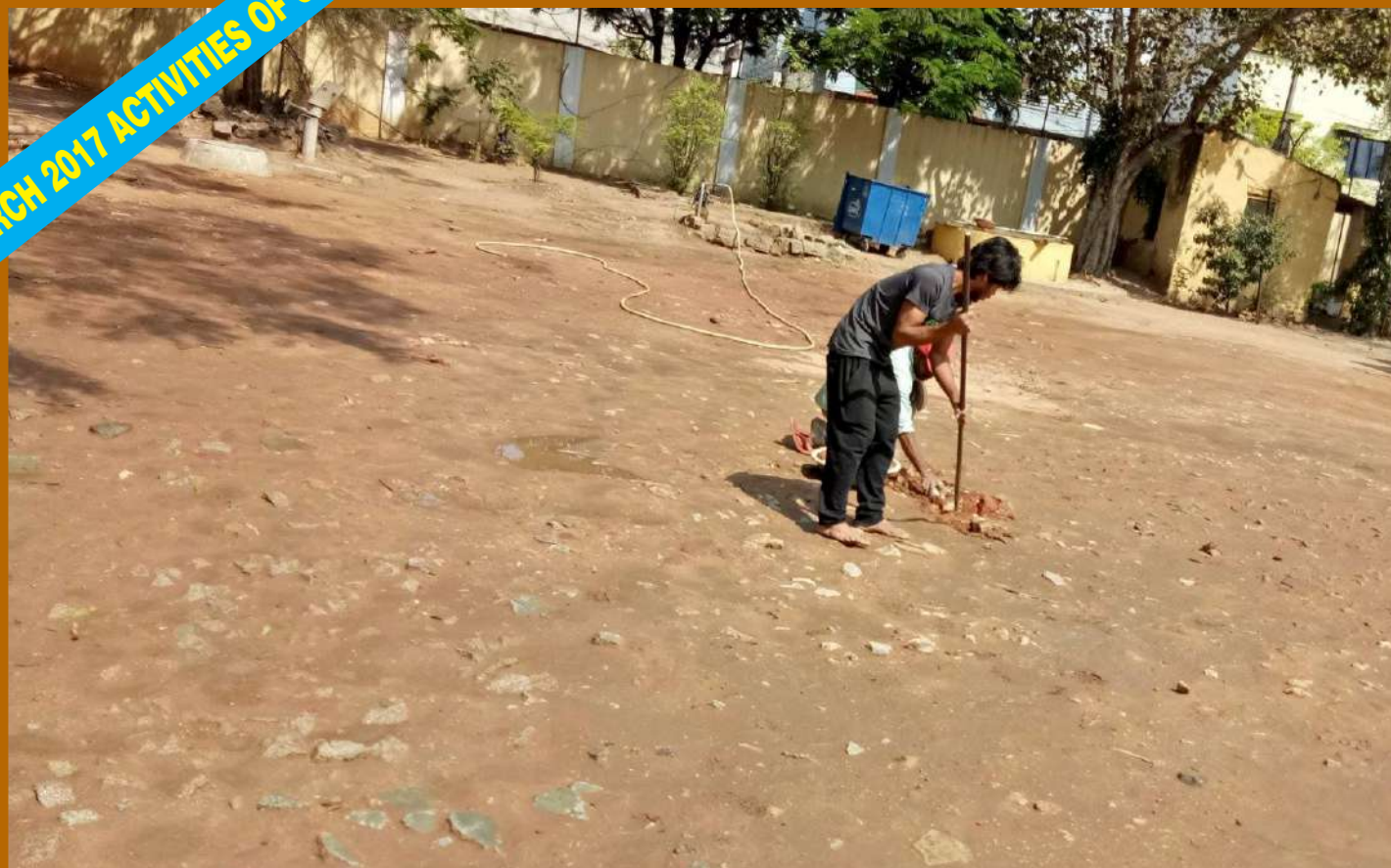
Intensive Ground Work which transformed the Juvenile Home Campus!