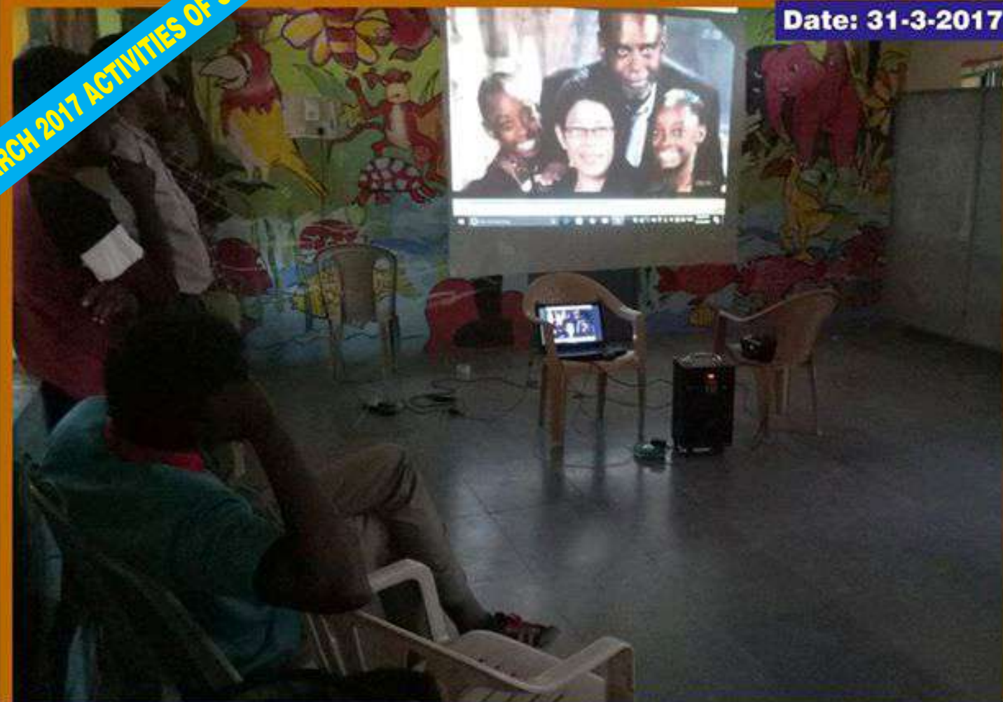
Girls being shown inspiring Audio-Visuals of Eminent Sportspersons...