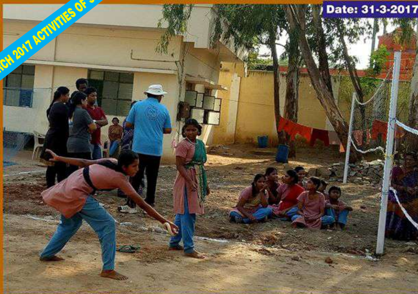
Girls in Action - Tennikoit and Badminton...