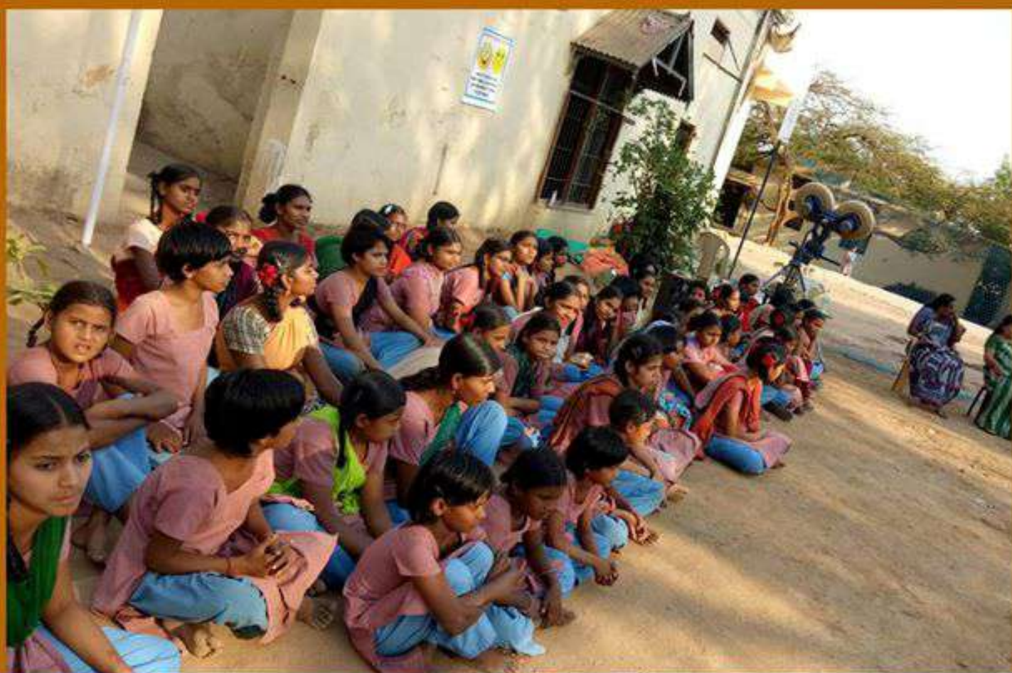
Juvenile girls listening in anticipation...