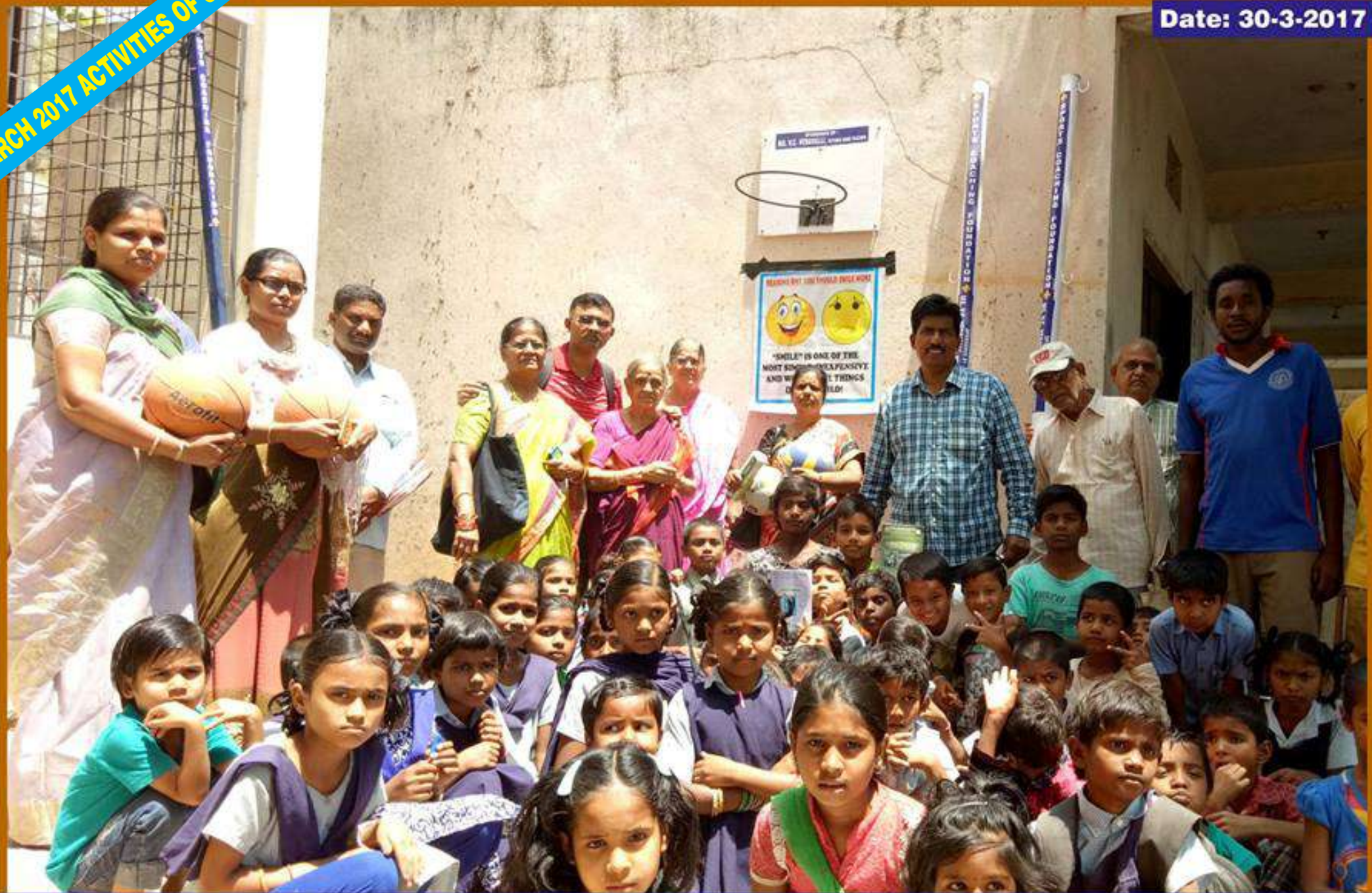
Time for a Group Photograph with the Children and Staff of the School...