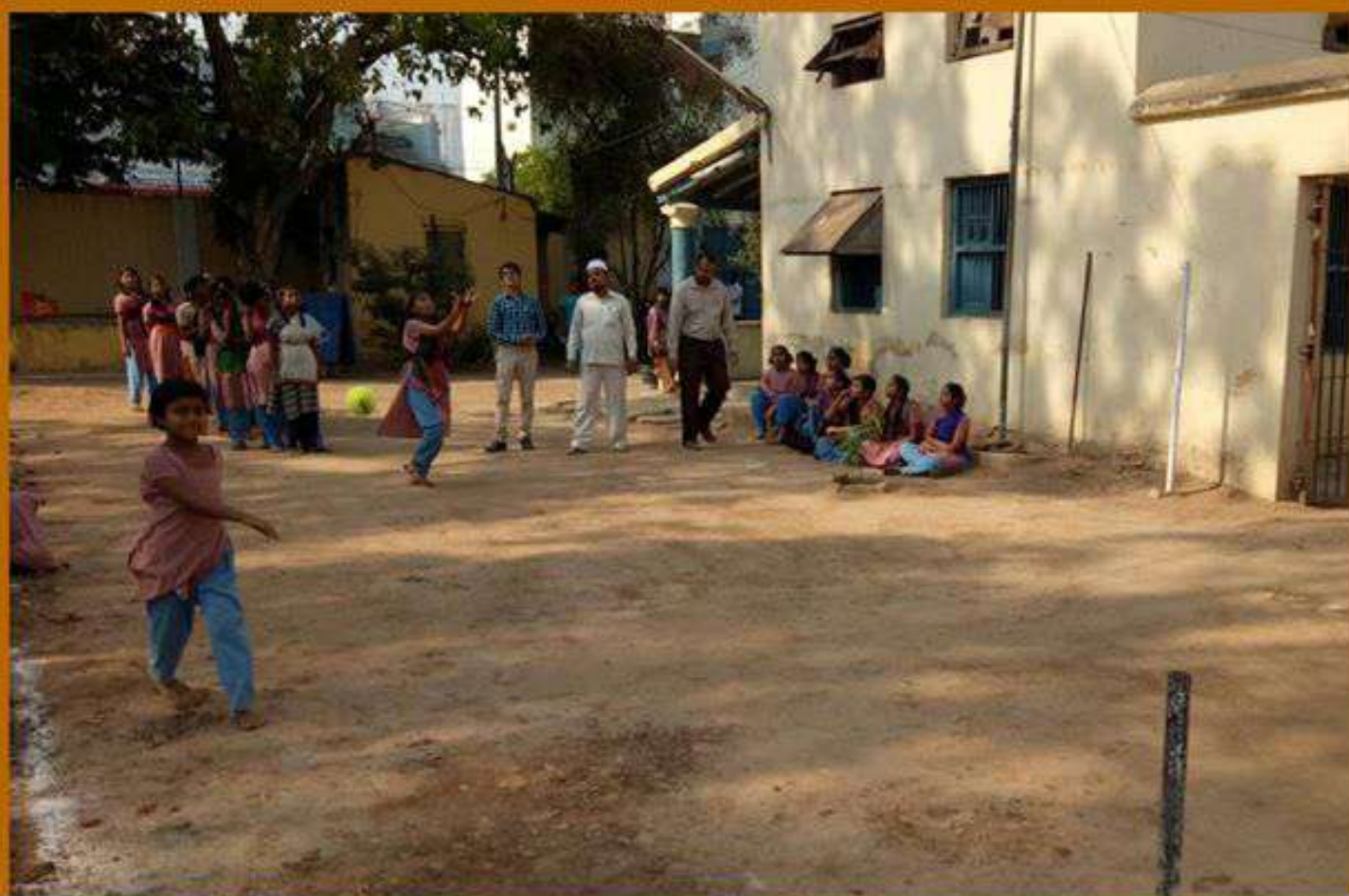
Sports Clinic in Action...