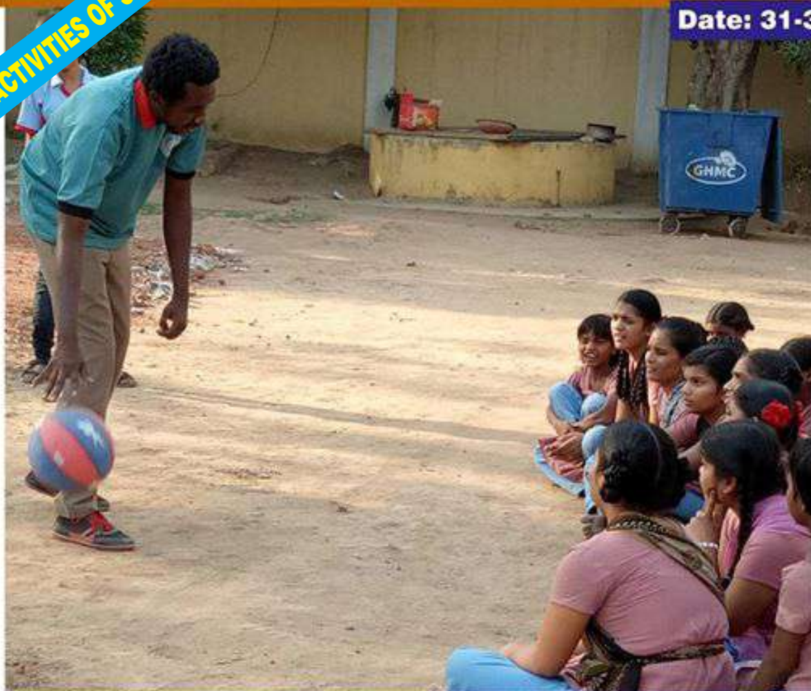
Girls being trained in Basketball basics...