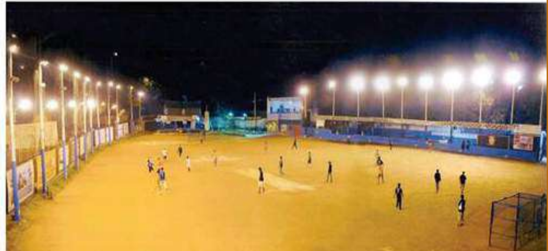
Night View of the Playground