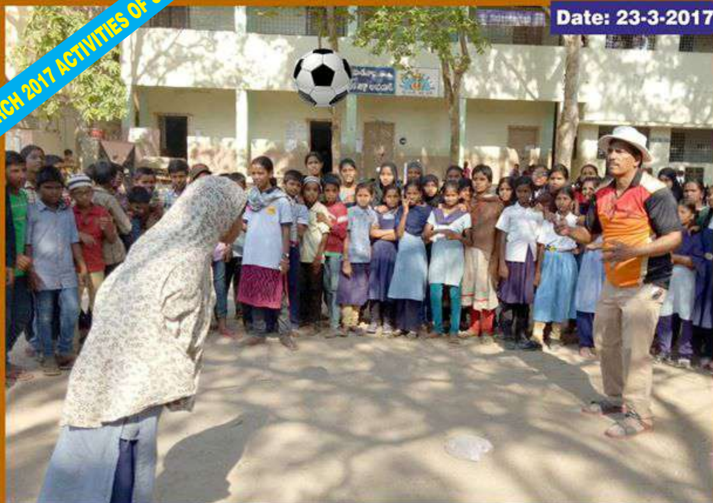
Heading the ball...