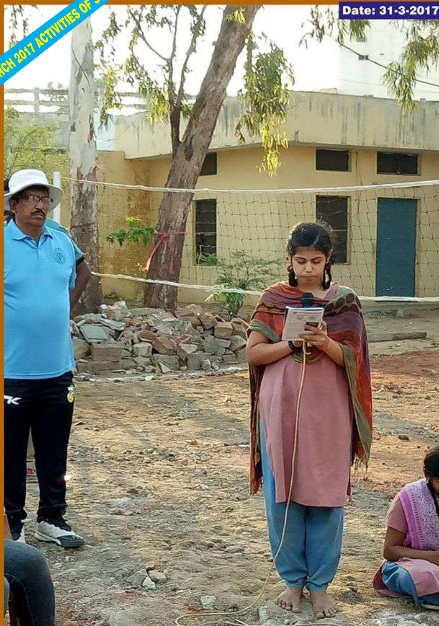
A Juvenile Home Girl drawing inspiration out of SCF Coaching Manual...