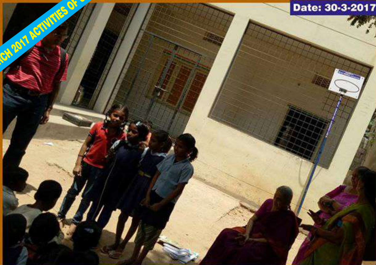
Children mesmerized by the Sports Clinic...