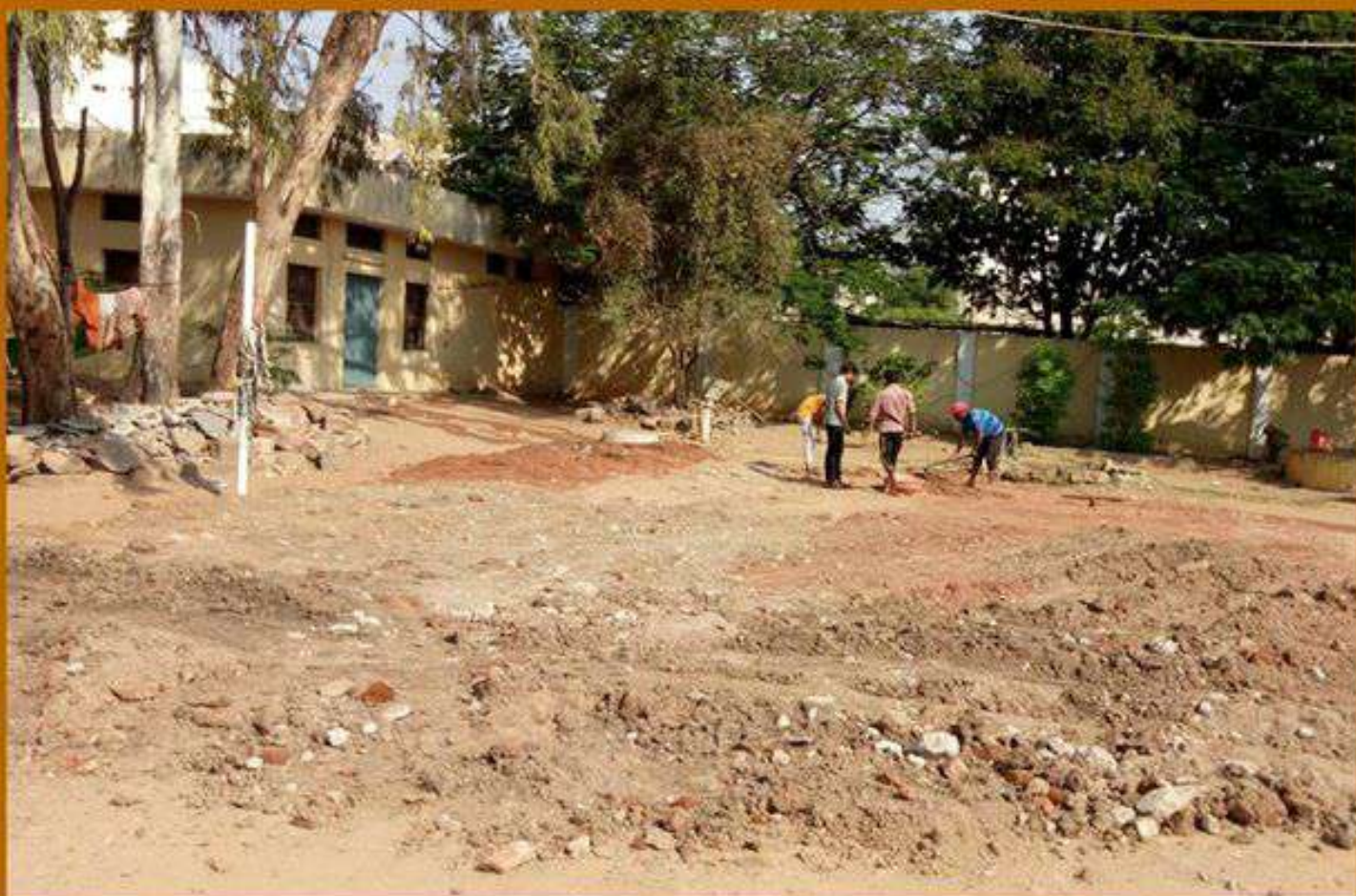
Preparation of Volleyball / Throwball Courts...