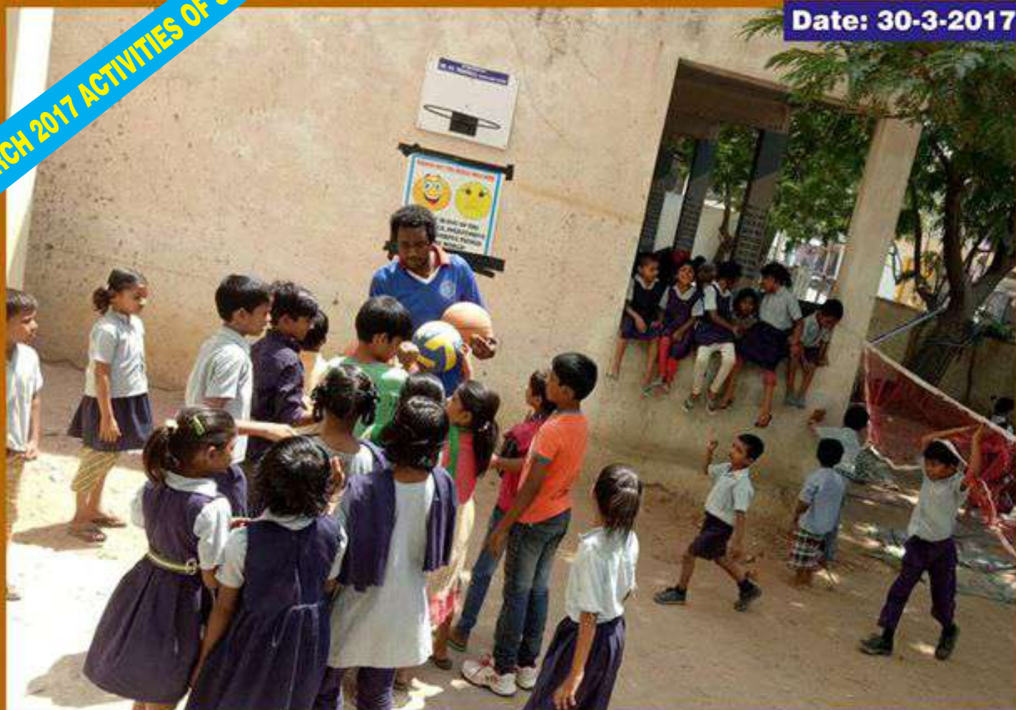
Inspiring BPL Children to take up Sports...