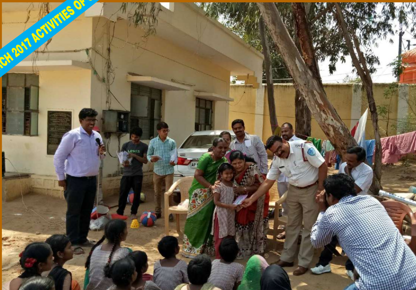
Group Photograph with the Sporting Juvenile Home Girls!