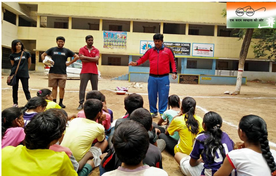
Mixed Football team listening the sports lessons