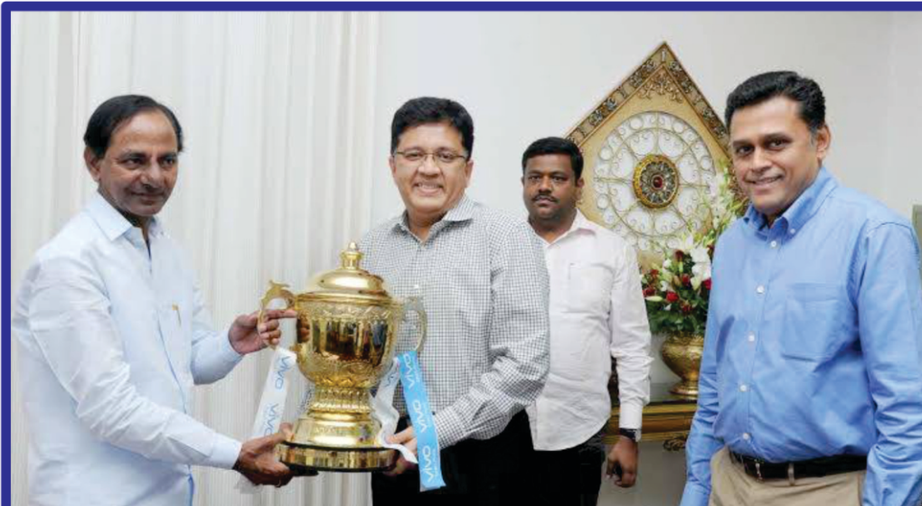
Sun Group Chairman Sri. Kalanithi Maran met the Honourable Chief Minister of Telangana Sri. K Chandrashekar Rao garu with the IPL trophy. The CM congratulated the SunRisers team. We thank the CM for his support and best wishes...