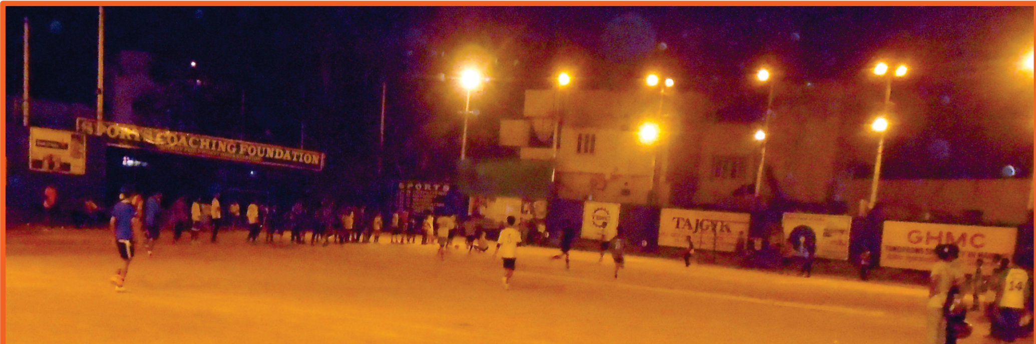
SCF Sports Complex with Football Activity under Floodlights....