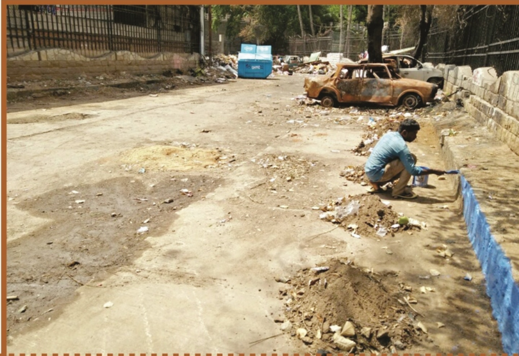
Swachh Bharath Abhiyan (Clean India) at outside Sports Complex, Masab Tank, Hyderabad...