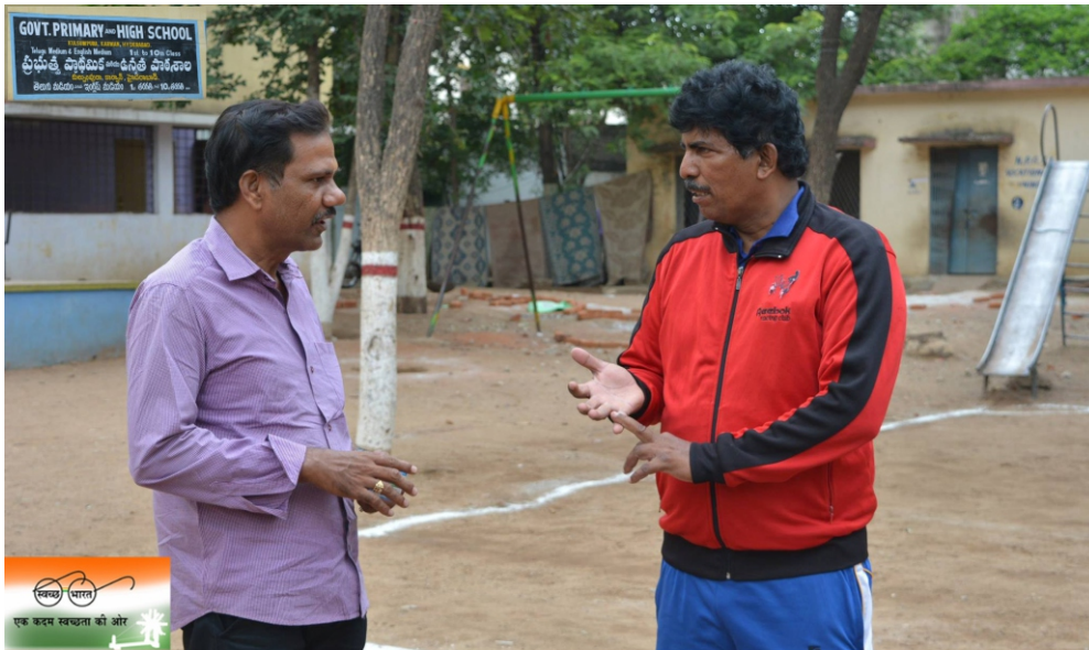
SCF Secretary explaining to School faculty ...