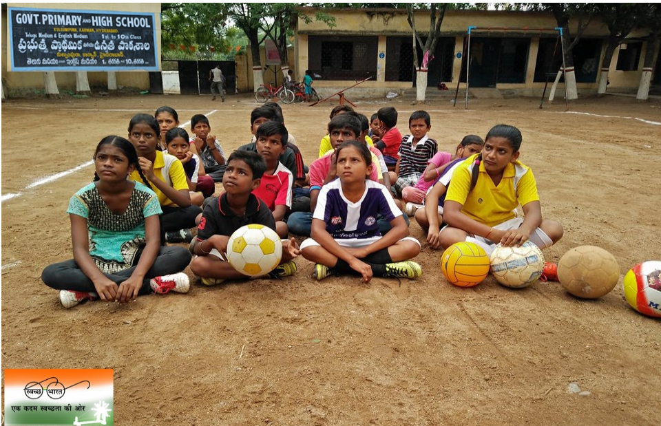
Mixed Football team listening the sports lessons