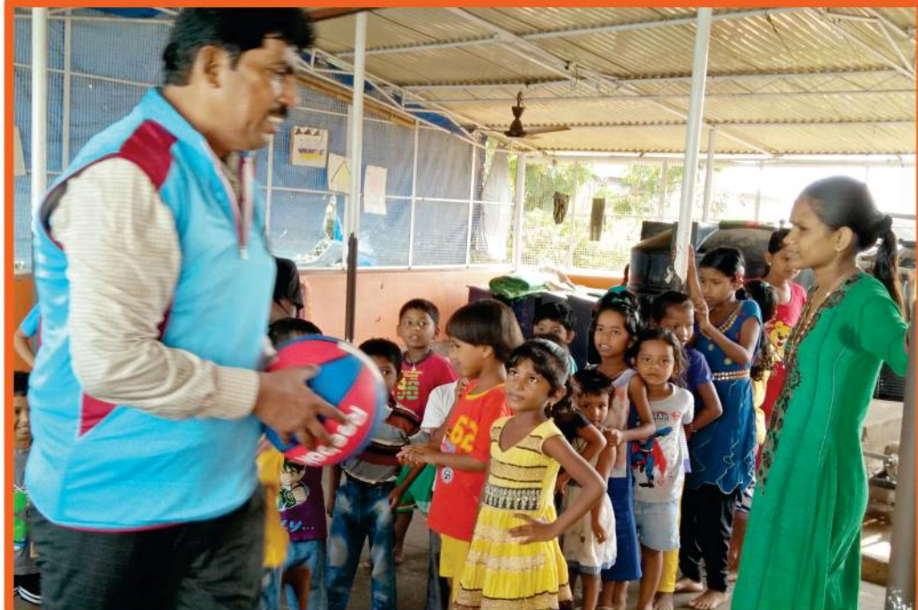
SCF at GOA Date: 3-6-2016