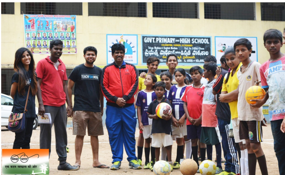
Education without sports is incomplete... 03-07-2016