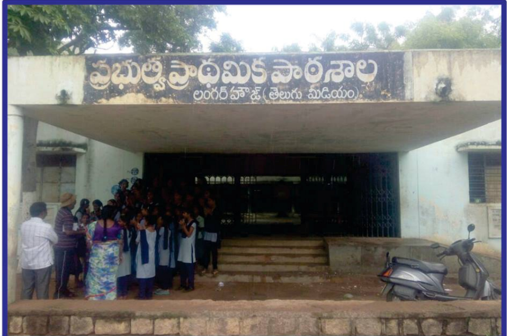
Govt. Girls High School, Langer House, Hyderabad...