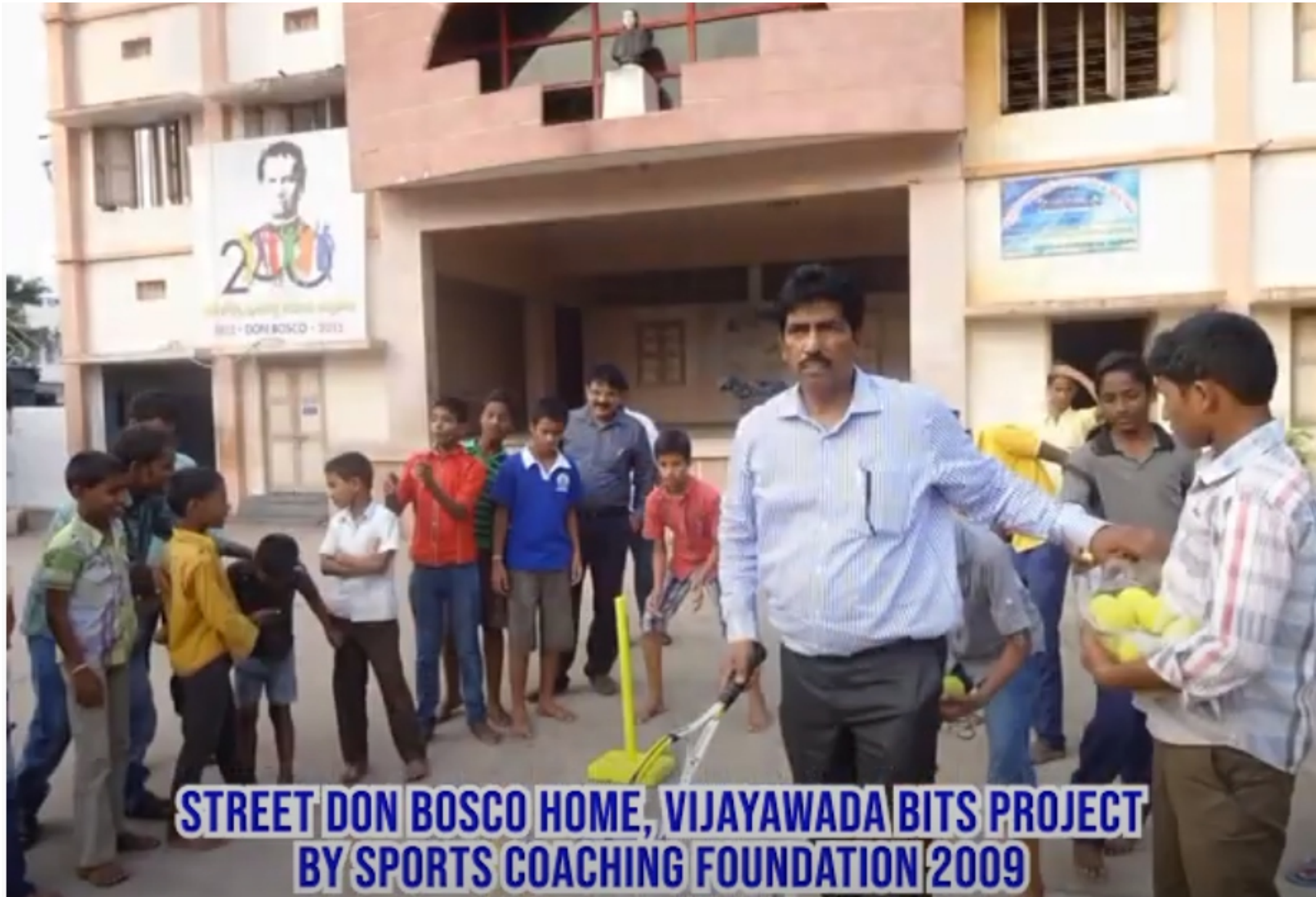
STREET DON BOSCO HOME, VIJAYAWADA BITS PROJECT BY SPORTS COACHING FOUNDATION 2009