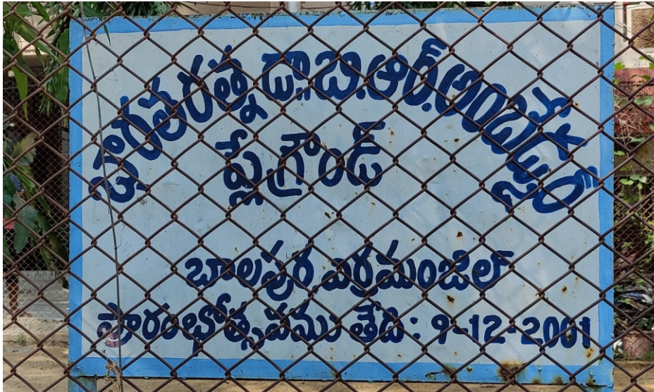
Under SCF BITS Project more than 500 most vulnerable children will be benefitted 1-12-2020