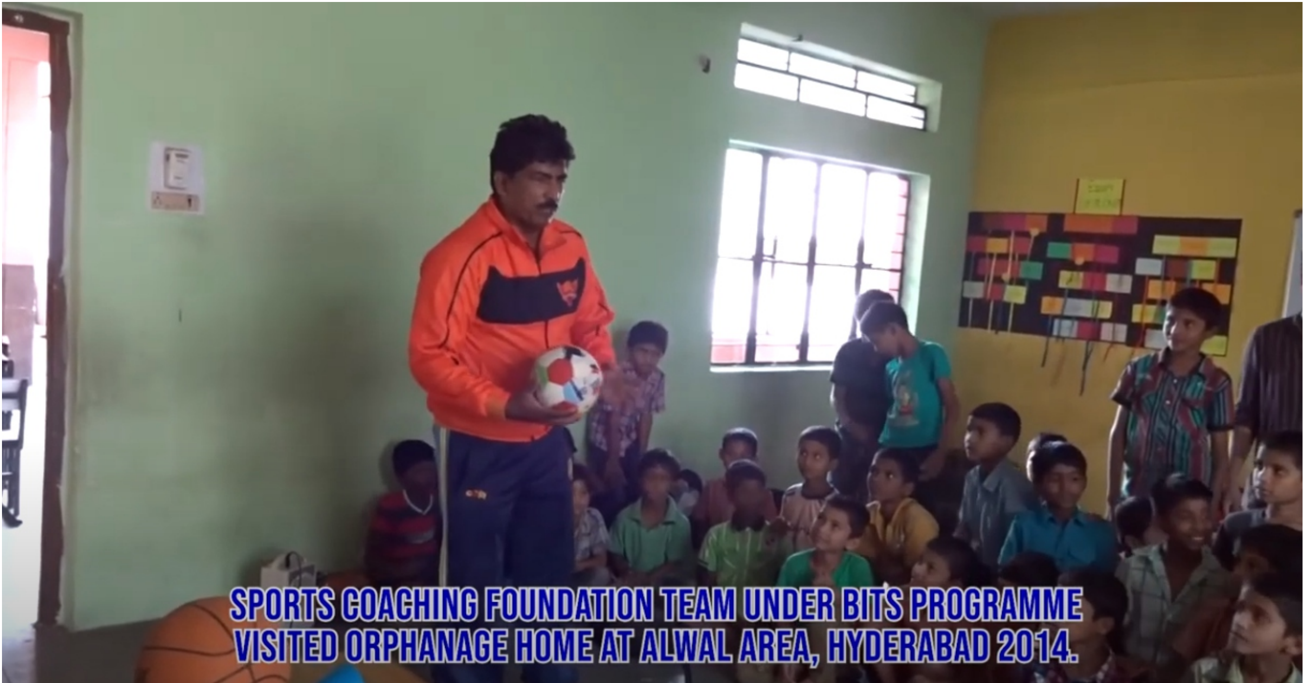
SPORTS COACHING FOUNDATION TEAM UNDER BITS PROGRAMME VISITED ORPHANAGE HOME AT ALWAL AREA, HYDERABAD 2014.