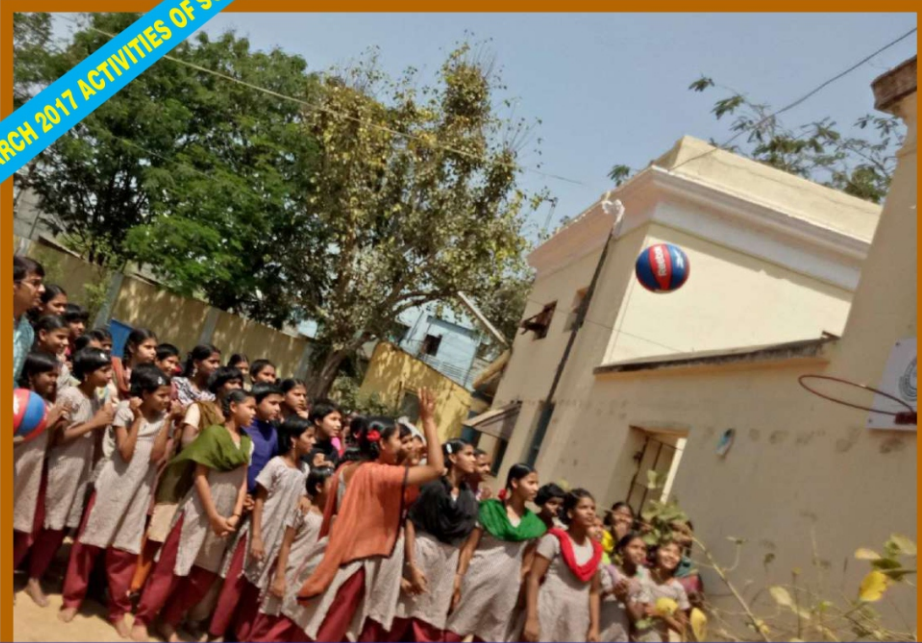
Now, it's the time for girls ....