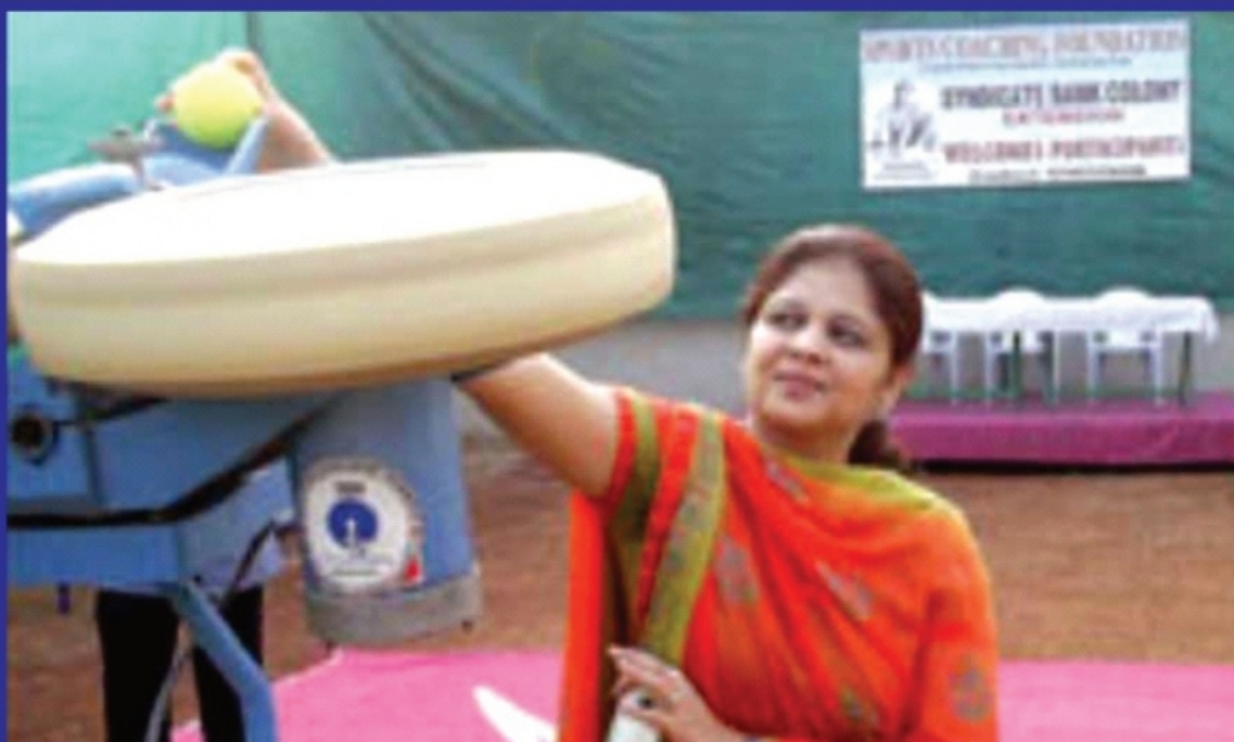
Syndicate Bank Colony, West Marredpally, Secunderabad