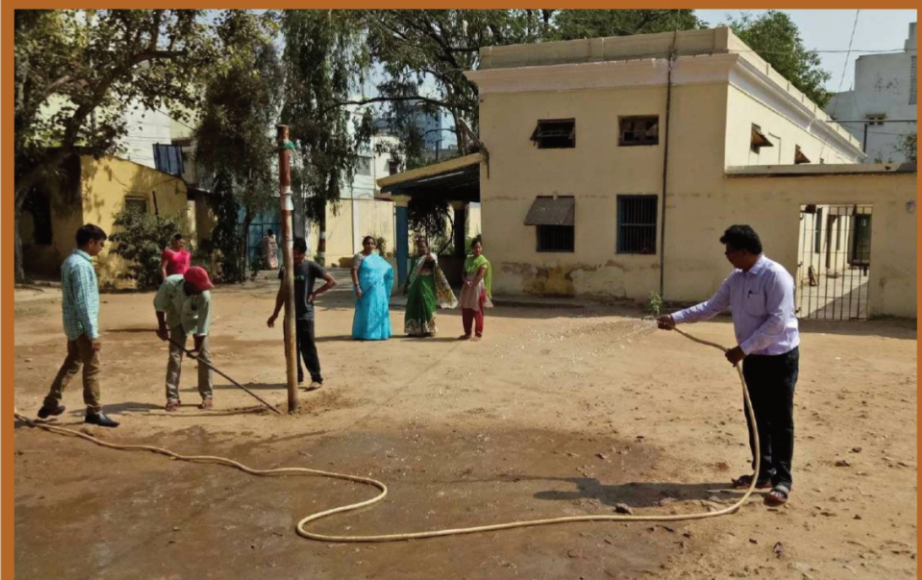
SCF supported a Govt. Juvenile Girls Home at Nimboliadda, Kachiguda, Hyderabad Video Link: Click here