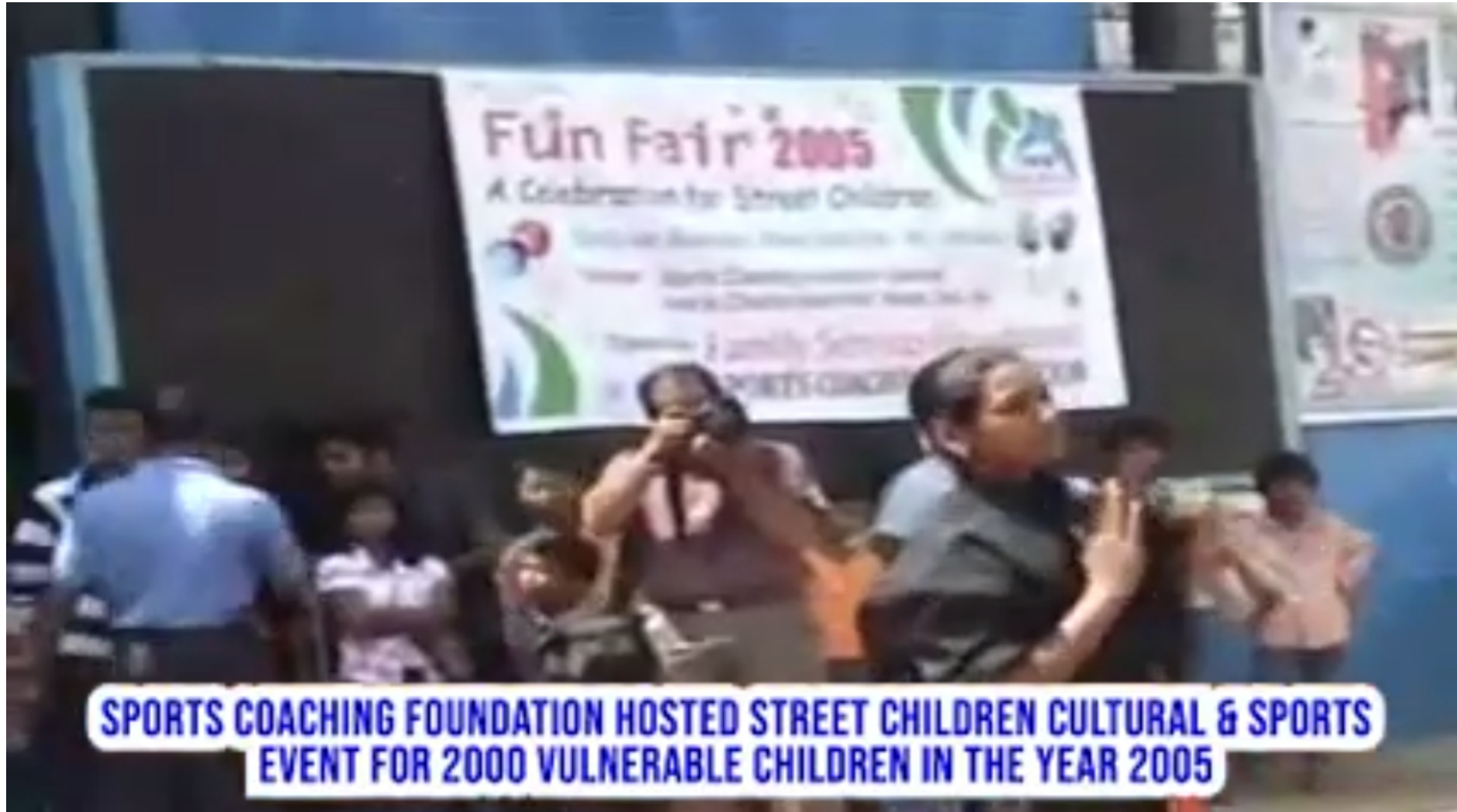
SPORTS COACHING FOUNDATION HOSTED STREET CHILDREN CULTURAL & SPORTS EVENT FOR 2000 VULNERABLE CHILDREN IN THE YEAR 2005