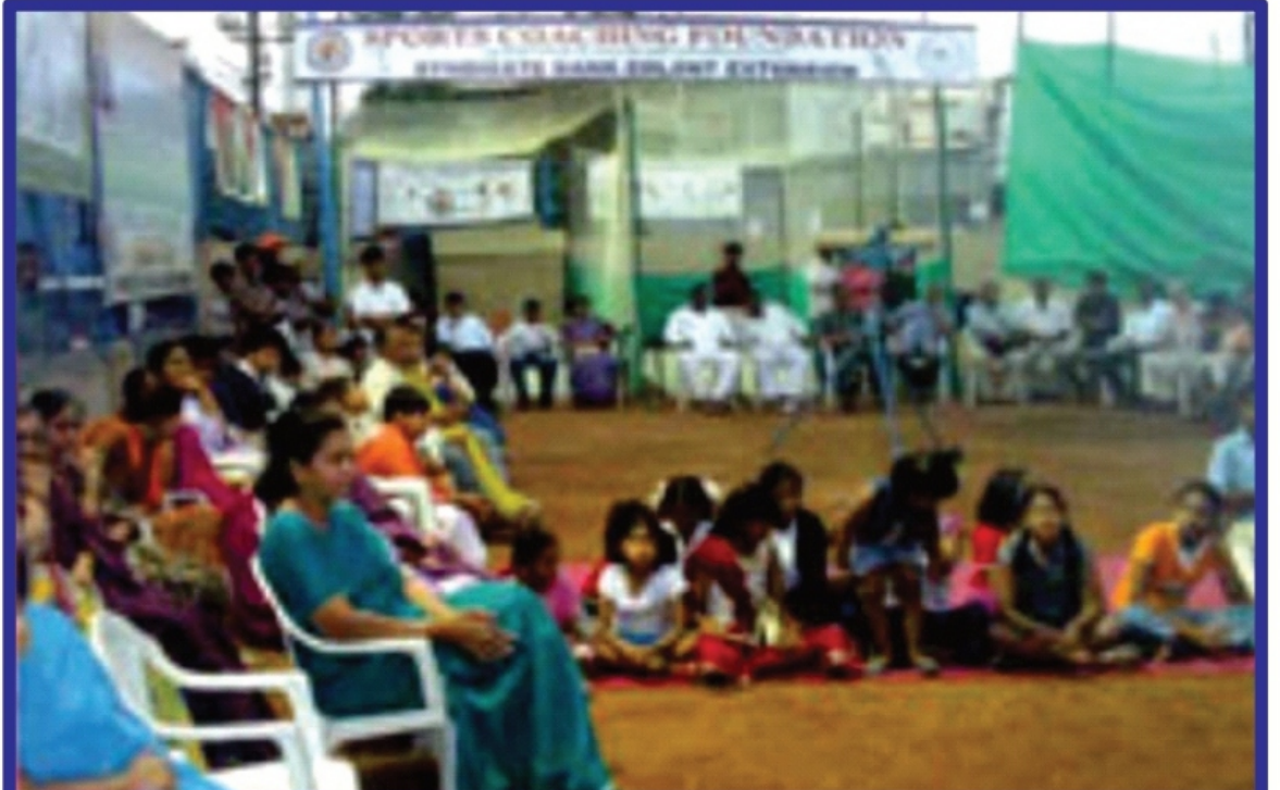
After 7 Days